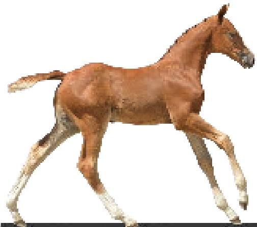
Power vd Peerdobos